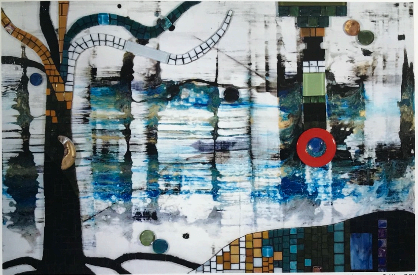
Urban Waterway, 36" x 30"