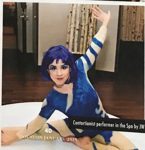
Contortionist performer in the Spa by JW