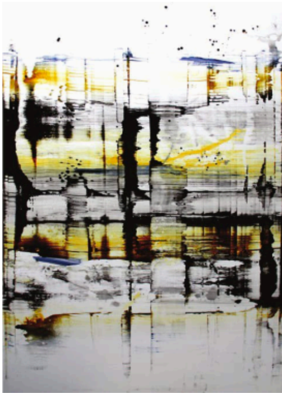
Thoughts at Dawn , 2011 Acrylic, ink, charcoal powder on panel 84 x 60 in.